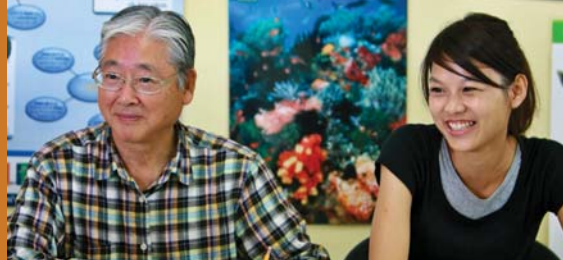
SAMPLE TIMETABLE: GENERAL ENGLISH (25 HOURS PER WEEK)