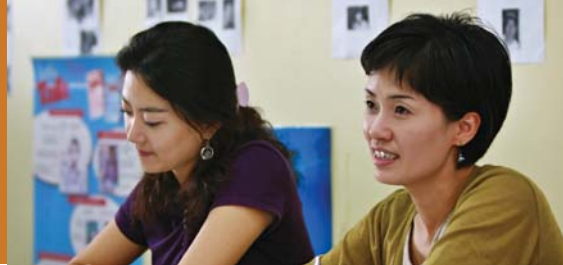
SAMPLE TIMETABLE: ENGLISH FOR ACADEMIC PURPOSES (25 HOURS PER WEEK)